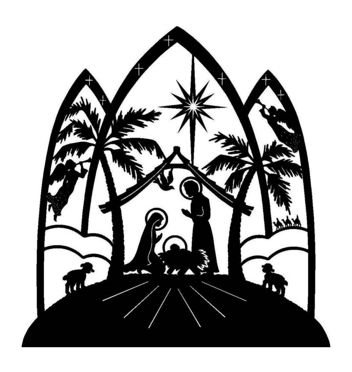
Christmas Carol Song Booklet